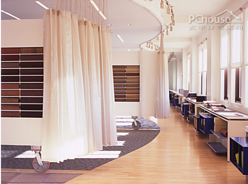
The Mohawk Group Flagship Showroom

A first for Mohawk, this flagship showroom was designed to host seven significant and distinct carpet and flooring brands, connected (functionally and metaphorically) by a curtain, weaving through all carpet brands.