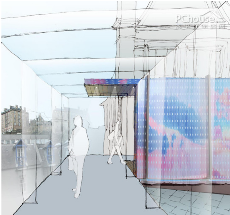
ECA Master Plan and Connector Bridge

lightly. inserts itself into the overall campus, framing views of the surrounding campus and city.