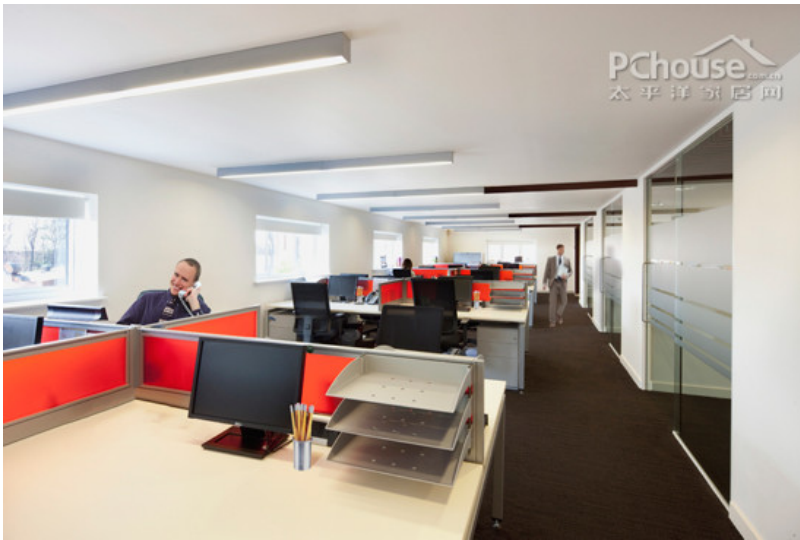
Inver House Distillers